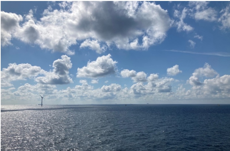
A sunny day in a North Sea offshore wind farm

Currently, I serve as the Associate Director for MWS projects at Waves Group. Many of the projects I oversee are part of the booming offshore renewable and subsea cables markets. Like many surveyors, I began my career supporting the oil and gas sector. I soon discovered the rules and standards of the oil majors are as extensive as they are non-negotiable. So, when I first started working on offshore wind projects, I was disappointed to see lessons where not being shared and a degree of "reinventing the wheel." While the offshore construction and renewables industries still face challenges, I am pleased to see the increasing emphasis on safety and quality today.